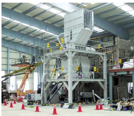
Erdwich Installation at Samsung

Erdwich's full company name is Erdwich Zerkleinerungssysteme GmbH so you will forgive us if we just say Erdwich. No one in our office has quite mastered the full pronunciation but we have had some funny moments trying.